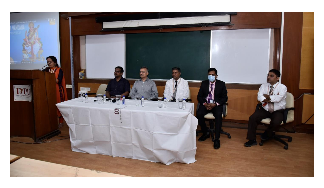
The occasion was blessed with the mesmerizing chants of "Sarswati Vandana"