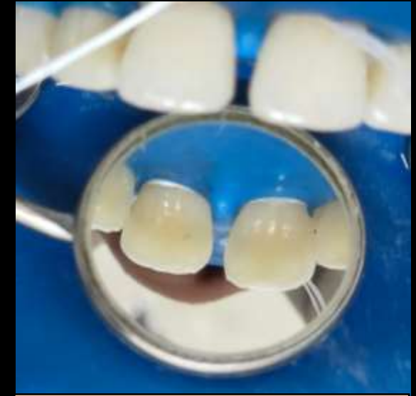
FINISH LINES AND BEVEL