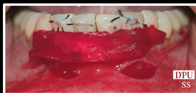
Incisions given to release the tension on the flap Curaspon (absorbable gelatin sponge) placed at the surgical area