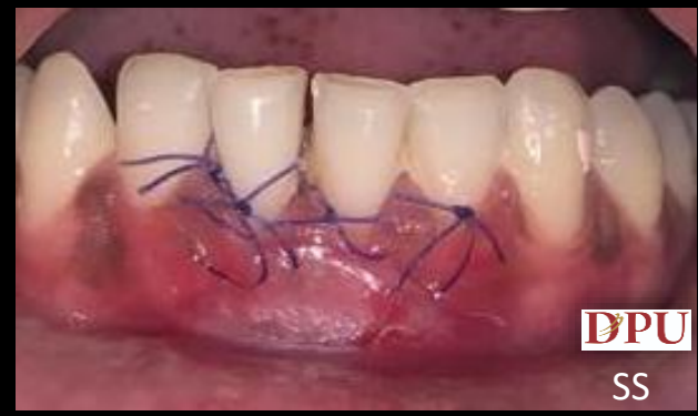
7 Days post-operative