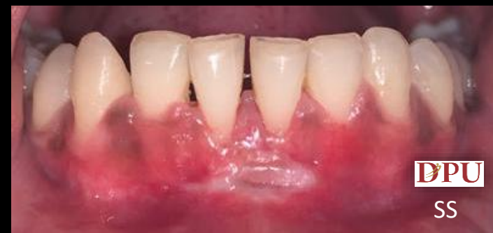
15 days post-operative