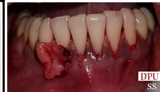
Insertion of second PRF membrane