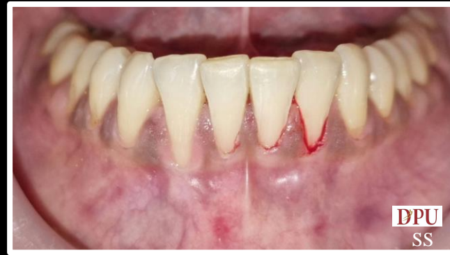
Mechanical Root Planing With Curette And Diamond Bur and Chemical Root Conditioning With Tetracycline