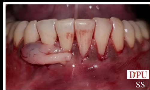
Insertion of first PRF membrane