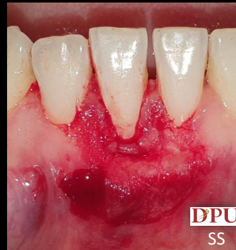
Recipient Bed Preparation