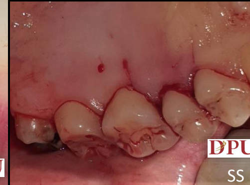
Incisions For Harvesting the Graft