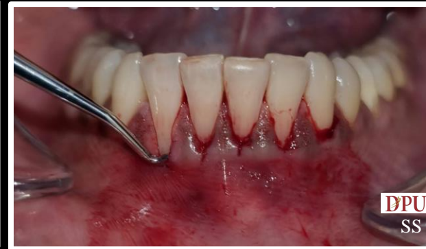
Tunnel preparation wrt 31,32,33,41,42