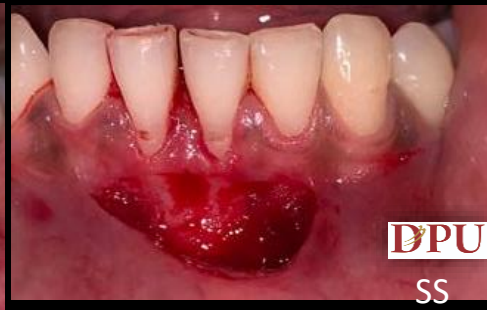
Graft bed preparation