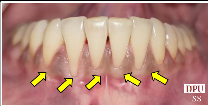
Pre-Op: Miller's Class III recession/ Cairo RT2 wrt 31,32,33,41 and 42