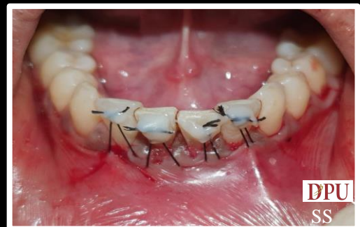
Composite stops and suspensory sutures placed. Tension present at the site