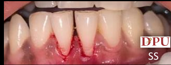
Scaling & Root Planing