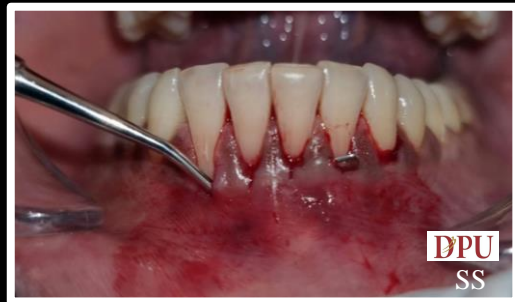
Complete releasing of the tunnel