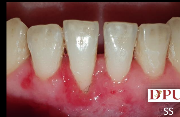
1 month post-op donor site