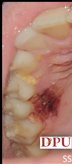
1 week post-op donor site