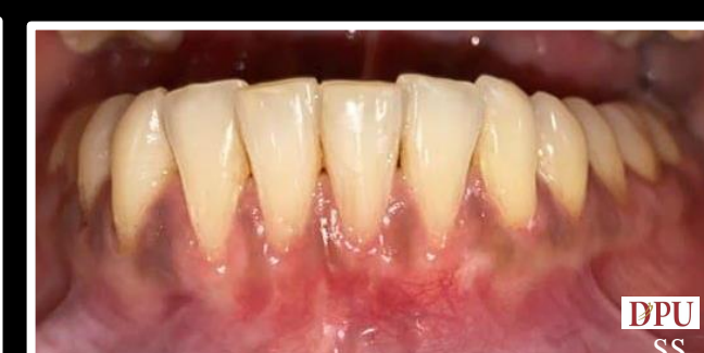
Post-Op after 3 months