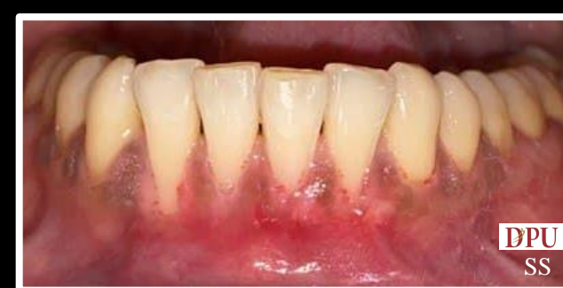
Sutures removed and debonding of composite stops done after 14 days