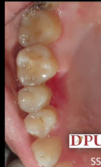
1month post-op Recipient site