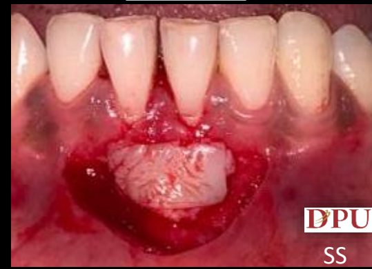
Placement of Graft on Site