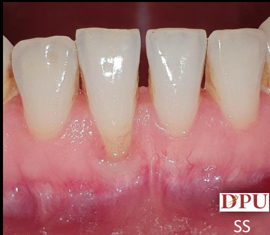
PRE-OP: Miller's Class III recession/ Cairo RT2 w.r.t. 41

Department of Periodontology and oral implantology.