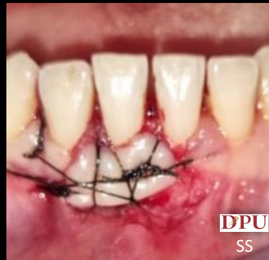
Graft placed and sutured on recipient bed