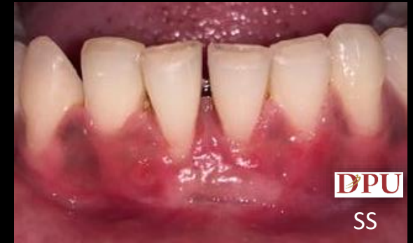
1 month post-operative