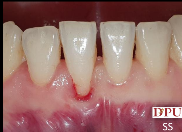
Scaling and Root Planing