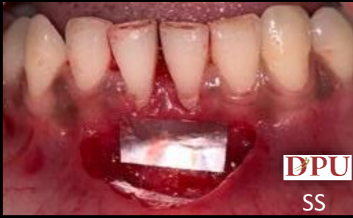
Aluminum foil template Measurement for grafting