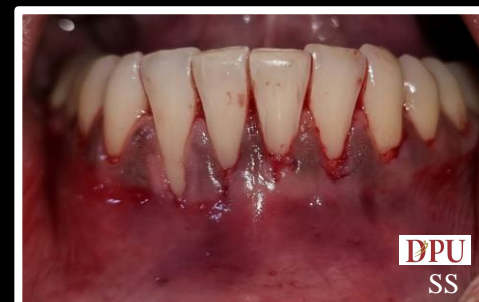
Fullness of the tissues seen due to insertion of PRF membrane